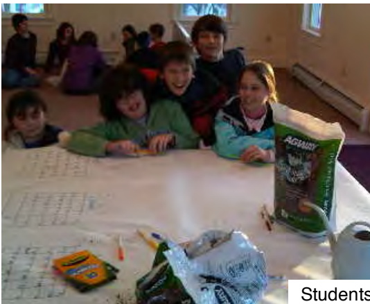
Students prepare to plant parsley for Tu B'Shvat.

Please see page ? for a full schedule of Shabbat and Holiday services.